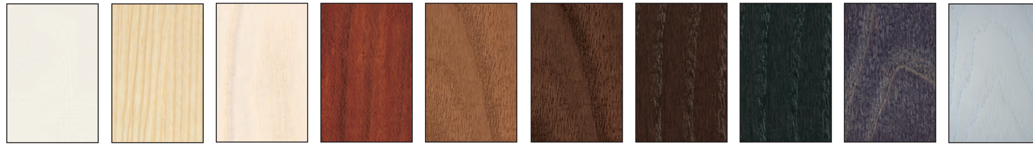
Bianco lipari Lipari white Naturale "forever" Natural "forever" Naturale sbiancato Whitened natural Mogano Mahogany Noce biondo Blond walnut Noce Walnut Noce moka Moka walnut Nero stromboli Stromaboli Black Antracite Anthracite Smoky